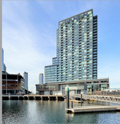
No.1 Collins Wharf