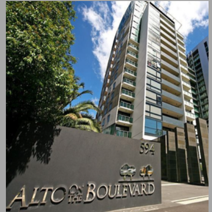
Alto on the Boulevard