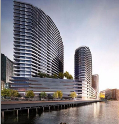
889 Collins Street

To view our entire portfolio visit fmv.com.au/portfolio